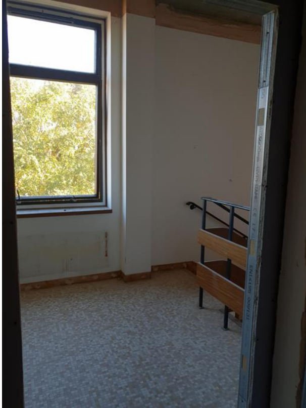
Stairwells flooded with natural daylight.