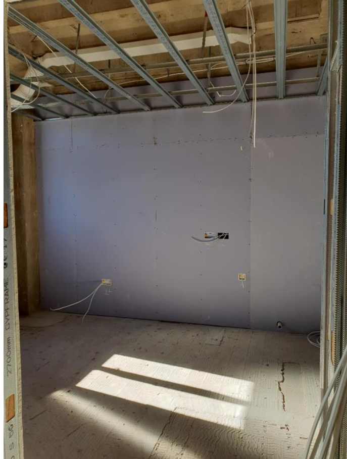
Electrics are almost complete on the upper levels.