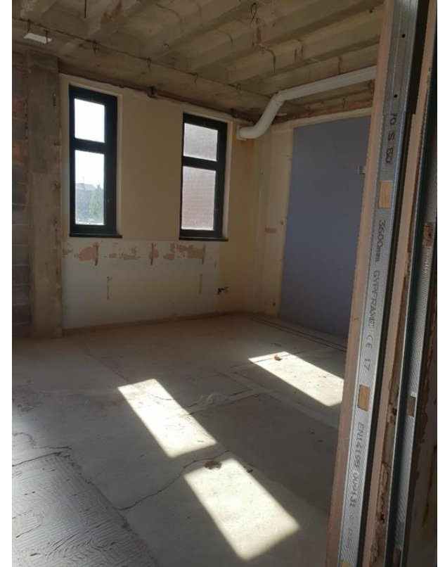
Space cleared ready for ceiling and walls.