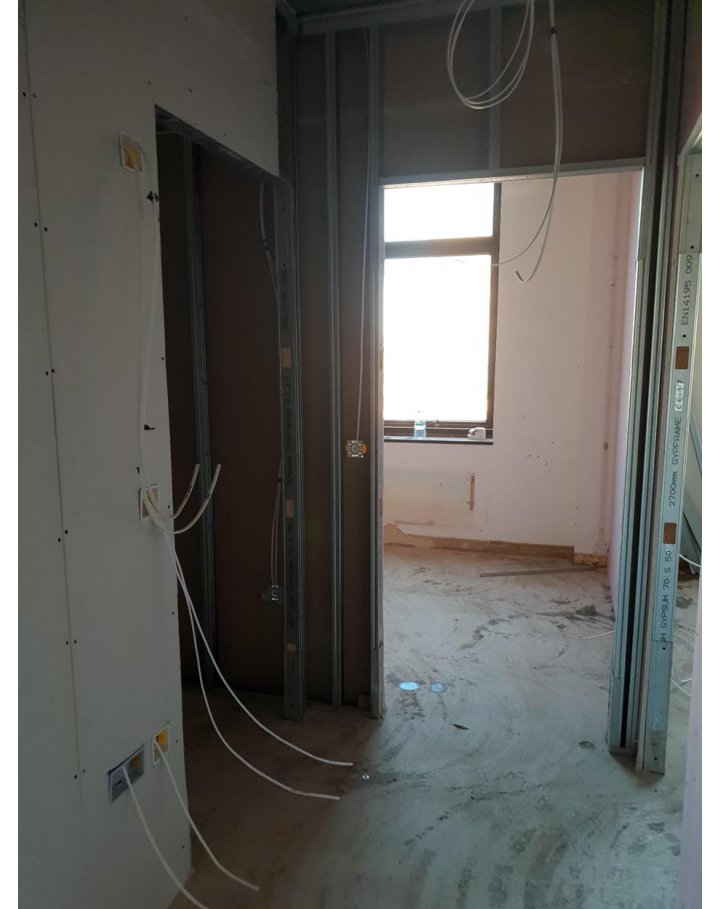
View of an apartment from it's entrance hallway.