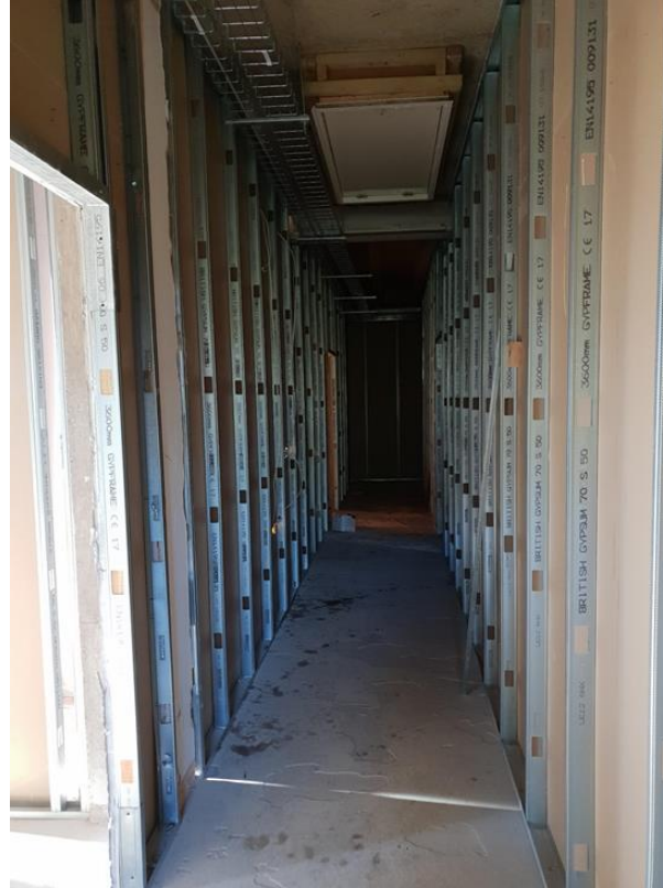
All corridor's in place on upper levels.