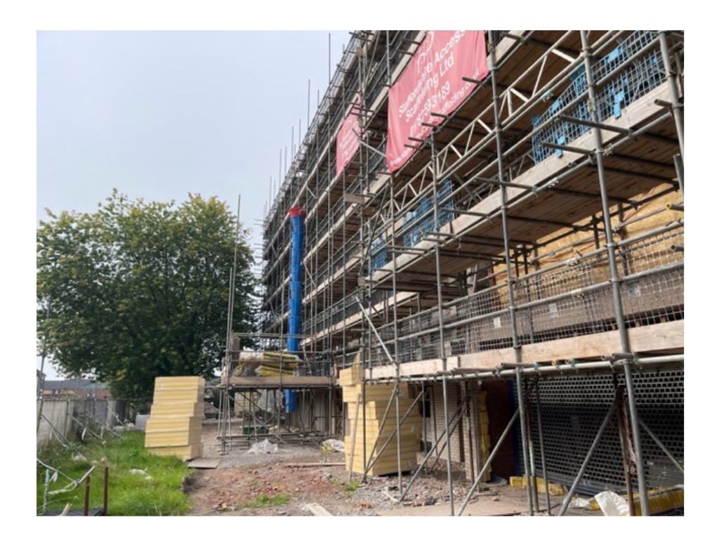
04— Block 02- Front Elevation Brickwork Progression