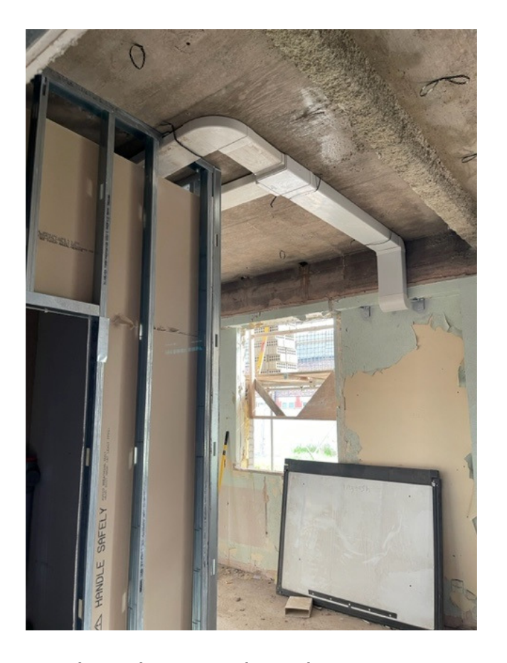
08— Block 02- Internal Metal Frame and Boarding Progression