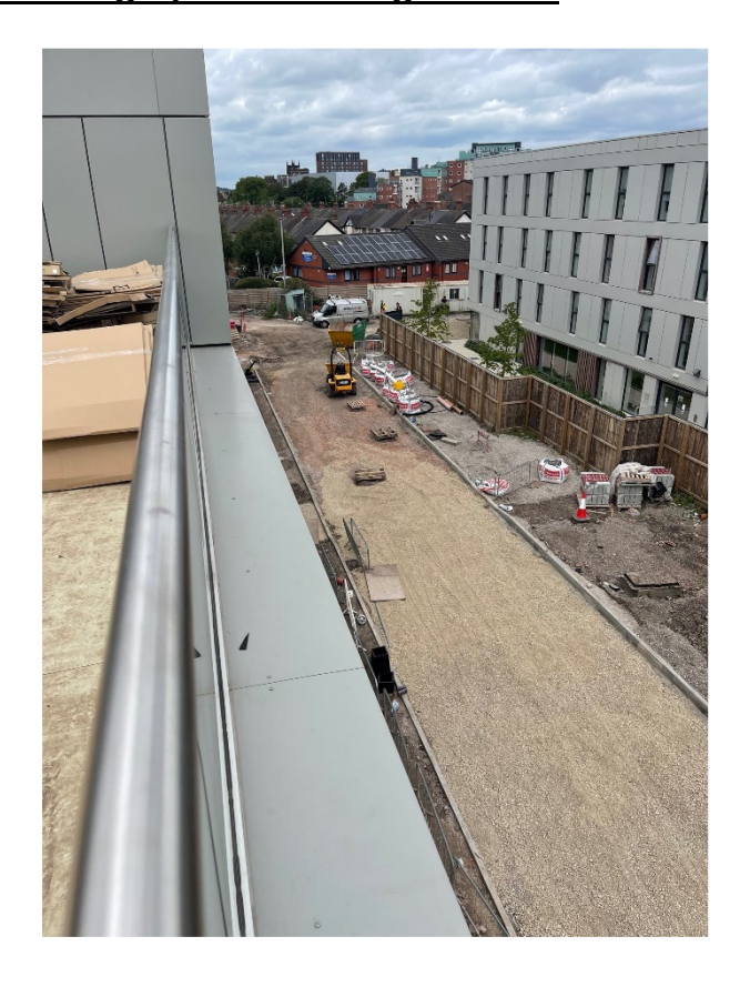
01-Block 04- View from Roof Terrace showing Access Road Construction