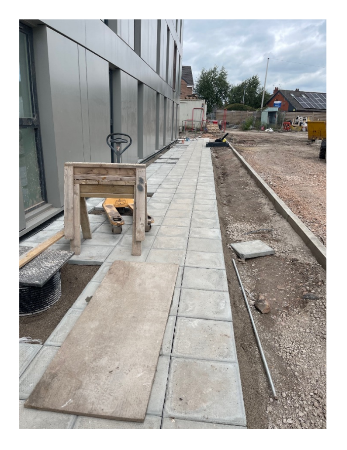
03— Block 04- Paving Installation to Front of Block