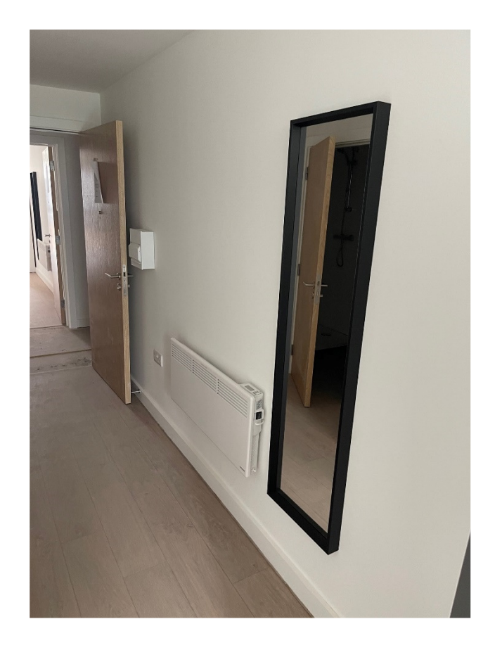
05— Block 04- Typical Apartment Furniture/Finishing