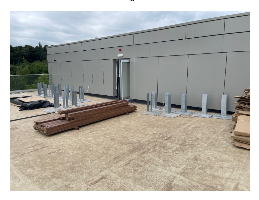
02— Block 04- Roof Terrace Decking Preparation