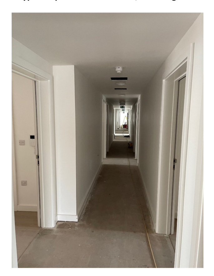
06— Block 04- Typical Corridor Progression